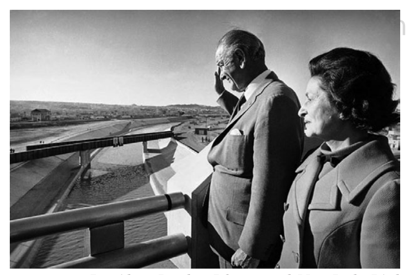
Figure 2. President Lyndon Johnson and Mrs. Lady Bird Johnson view the new channel. Associated Press, Dec. 13, 1968.

Figure 1. International Boundary and Water Commission, United States and Mexico, Relocation of Rio Grande, El Paso, Texas–Ciudad Juarez, Chihuahua, Preliminary Plan (July 25, 1963), Annex to Chamizal Convention, 15 U. S. T., following p. 36, T. I. A. S. No. 5515.