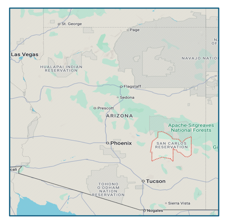
(Figure 2. Present San Carlos Reservation).

federal government seized more of the San Carlos Reservation, reducing its territory six times.<sup>49</sup>