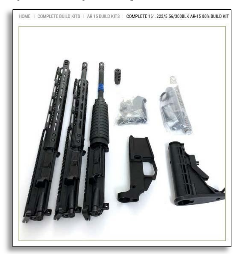
Fig. 1: AR-15 80% Assembly Kit<sup>9</sup>

the need for other measurement tools and make drilling the remaining holes simple. ^8