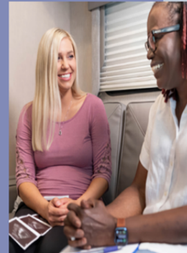
Client advocate session onboard an Image Clear Ultrasound Mobile (ICU Mobile) medical mobile unit in Akron, Ohio.

*a fraction of centers charge a low fee for STI testing