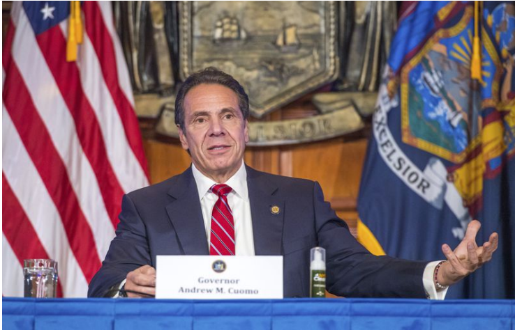
New York Gov. Andrew Cuomo

"It's time for a reality check," he said. "These are dangerous times for us."