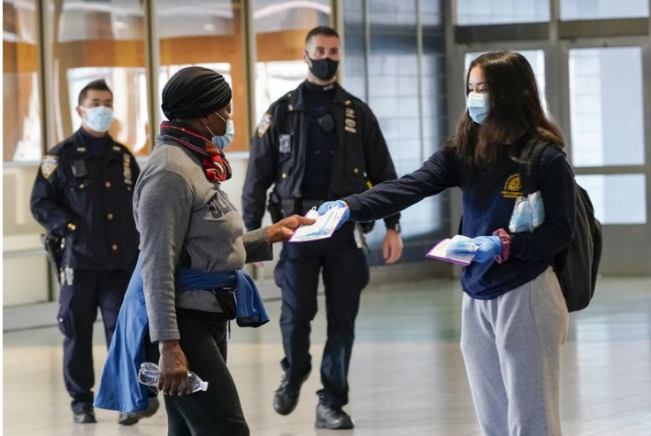
A canvasser, right, hands out free face masks at the ferry terminal, Tuesday, Nov. 10, in the Staten Island borough of New York. New York City officials are raising awareness and its efforts in stemming a rise in COVID-19 on Staten Island.

“This can not be a normal Thanksgiving,” he said. “The cases are already on the increase and we are coming into the high social season (with) Thanksgiving and Christmas. ...This is a toxic cocktail.”